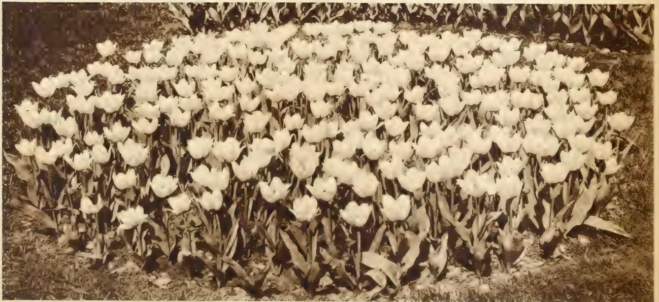
HENDERSON'S SUPERIOR SINGLE EARLY TULIPS

Mixed by ourselves from named sorts, proper proportions of bright colors, all blooming together and of uniform height; extra fine bulbs, much superior to the ordinary mixtures, which are too often made up of surplus varieties and seconds regardless of bedding effect. Price, 40c. per doz.; $3.00 per 100; $27.50 per 1000. 250 sold at the 1000 rate. (Same weights as preceding.)